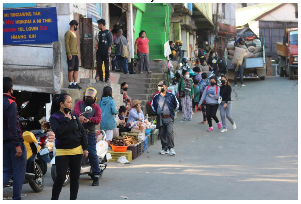
Fig. 3(b). Vaivakawn – Street Vendors in Vaivakawn have the highest vulnerability in Aizawl