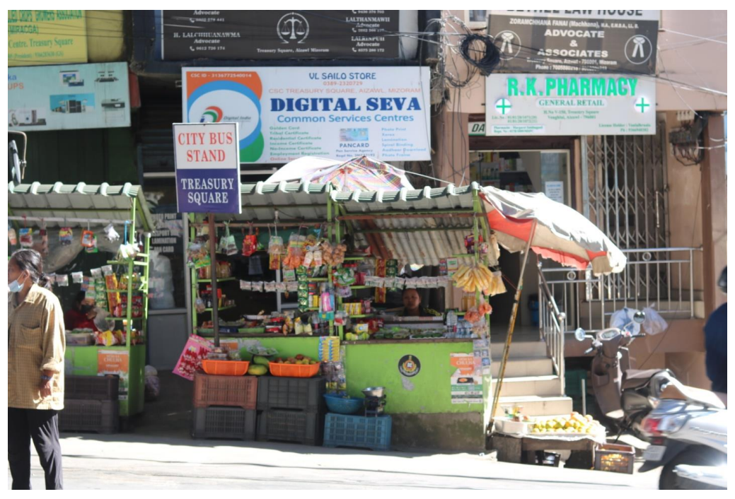
Fig. 3(a). Treasury Square – Street Vendors in Treasury Square have the least vulnerability in Aizawl